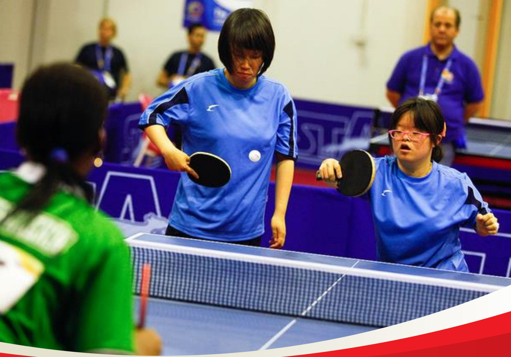
Table Tennis Sport Rules